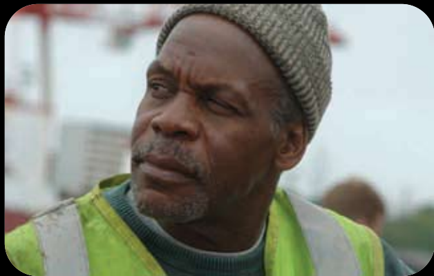
Danny Glover stars in the heartrending Poor Boy's Game which uses boxing as a metaphor as it explores racial tensions in a Halifax community.