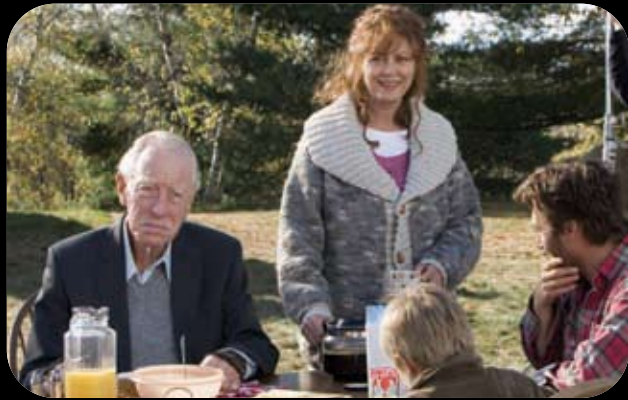
Christopher Plummer and Susan Sarandon in Emotional Arithmetic by Seville.com Theatrical.